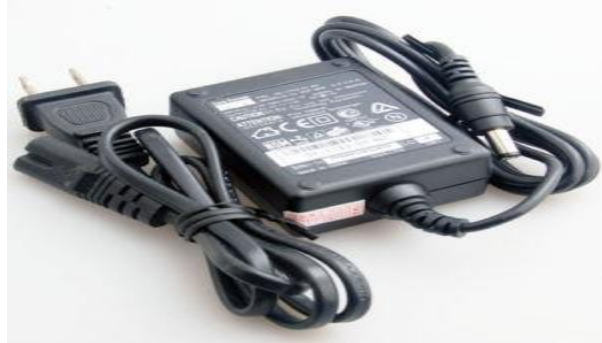
Cisco power supply adapter

Note: For other brand of modem provided by Royal Cable ; no lights on indicator light of modem. Power supply can be check using analog / digital multi-tester.